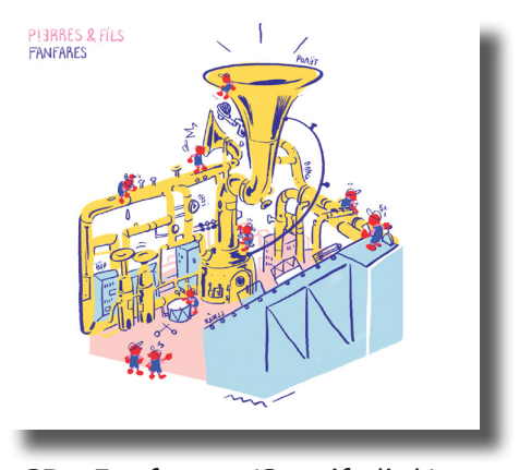
CD «Fanfares» (Spotify link)