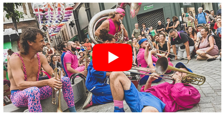
Live video in Aurillac Street Theater Festival 2024 (Youtube Link)